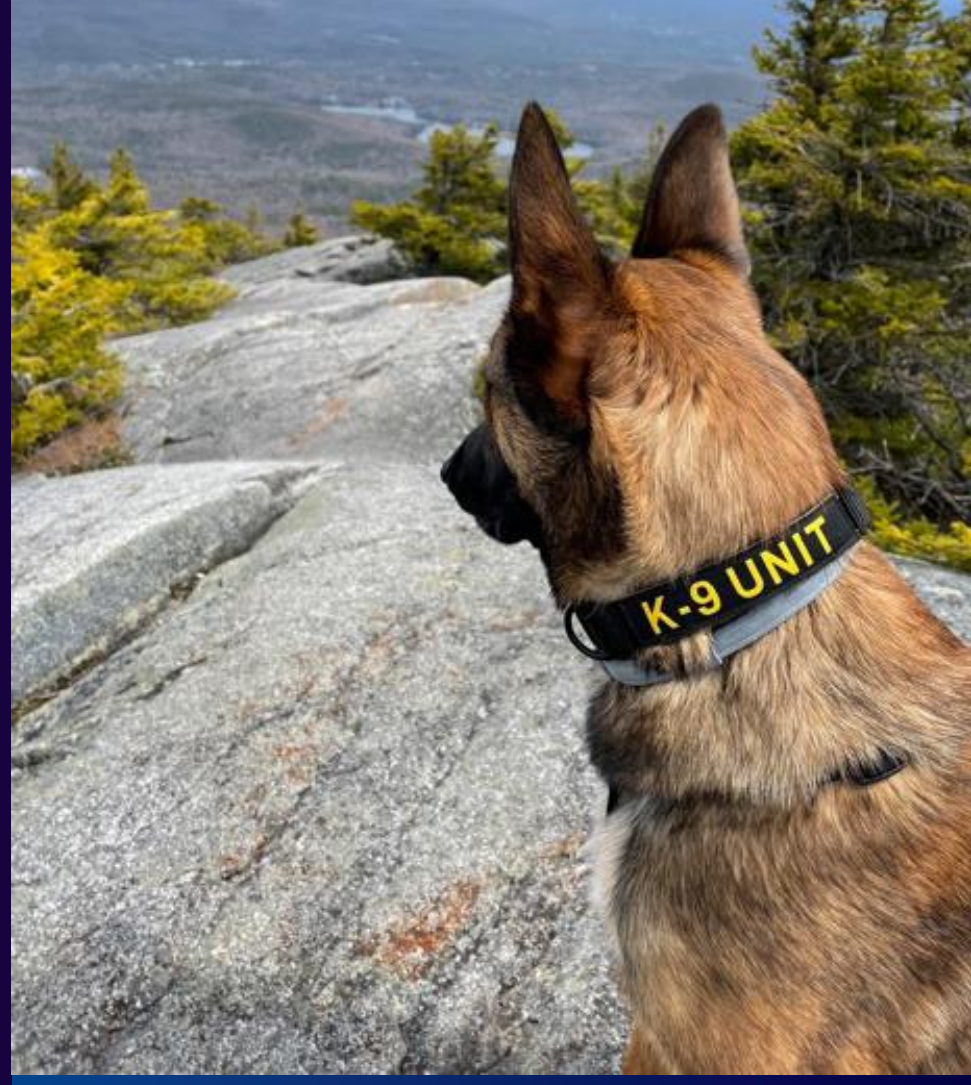
K-9 Nash